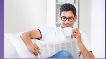
STAGE 1 - Bright light (100%)