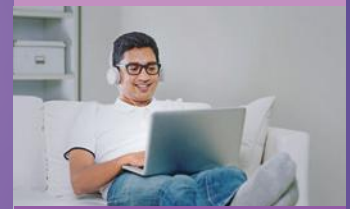
STAGE 2 - Medium light (50%)