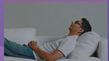
STAGE 3 - Dim light (25%)